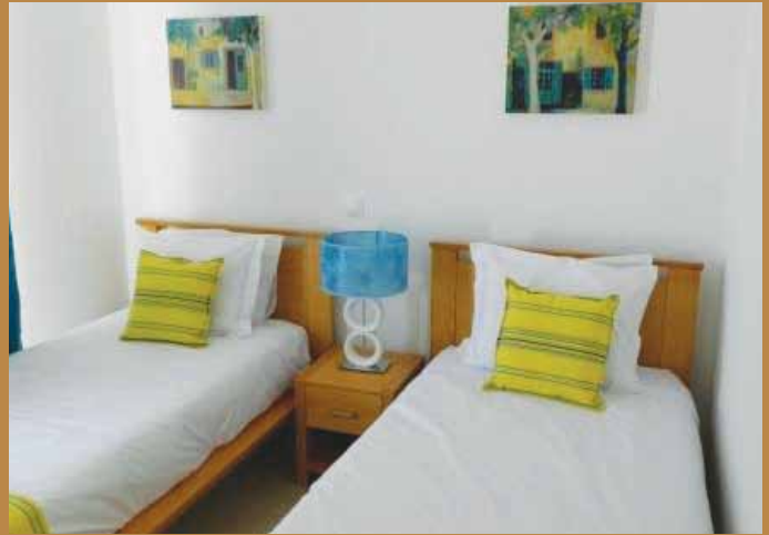
Luxury furnishings from Samuel Home