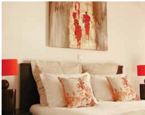
Dreamy Bedroom linens and furniture packs.

Bringing years of luxury furnishing experience to Cape Verde